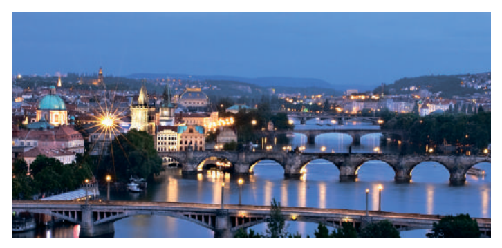
Czech Republic, Prague